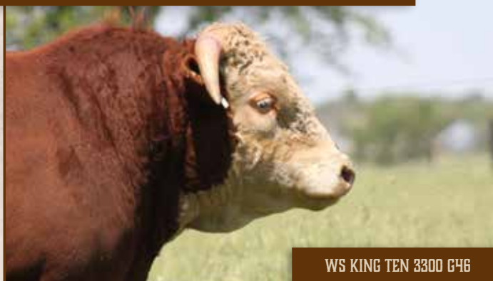
WS KING TEN 3300 G46