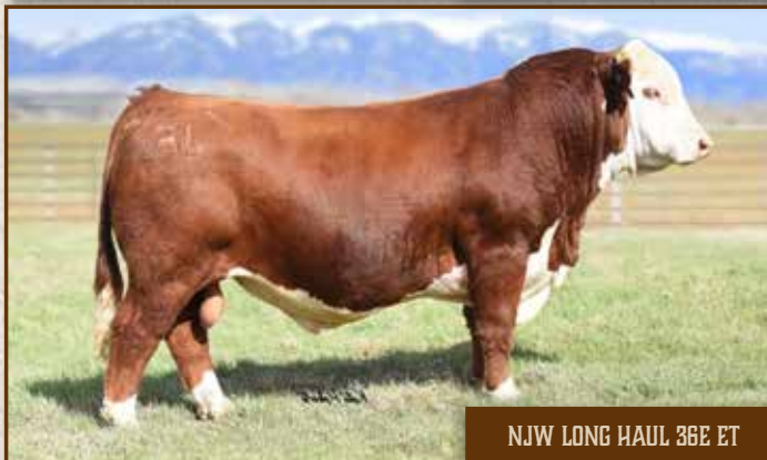
NJW LONG HAUL 36E ET