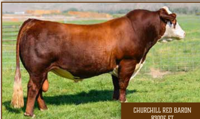
CHURCHILL RED BARON 8300F ET