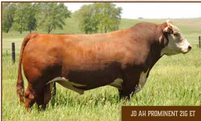
JD AH PROMINENT 21G ET