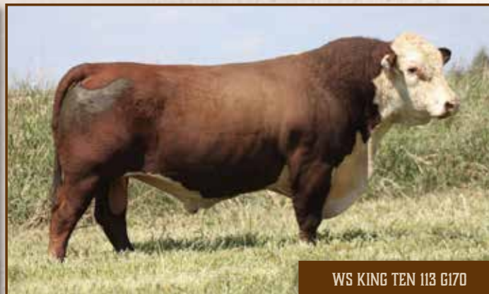
WS KING TEN 113 G170