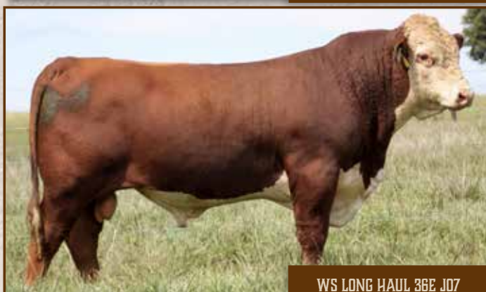
WS LONG HAUL 36E J07