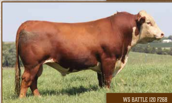
WS BATTLE 120 F268

JD AH Prominent 21G ET Homozygous Polled JDH 11B Stud 3134 63E 44014204