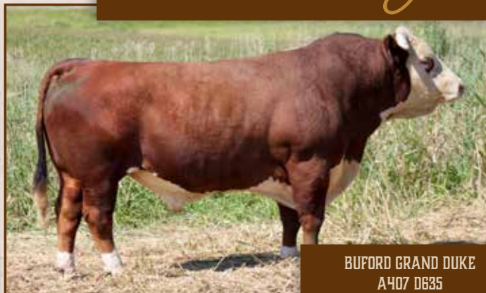
BUFORD GRAND DUKE A407 D635