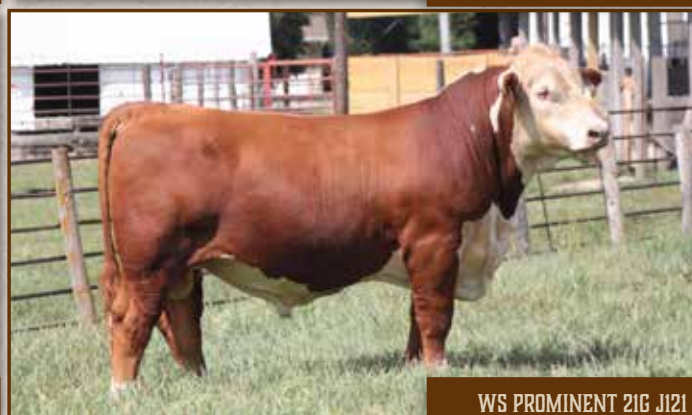
WS PROMINENT 21G J121