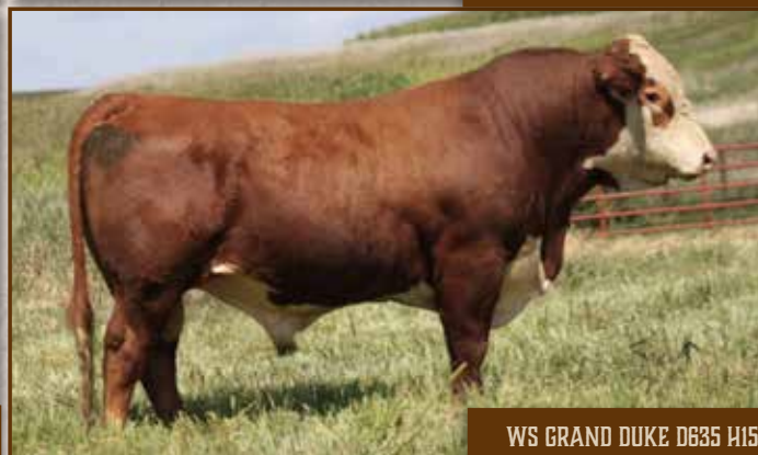
WS GRAND DUKE D635 H152