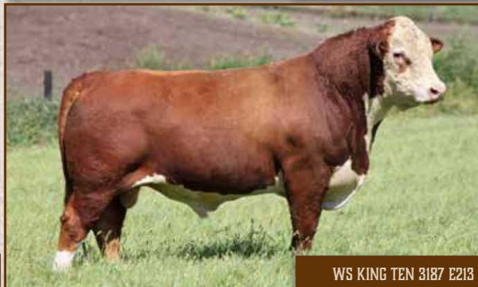
WS KING TEN 3187 E213