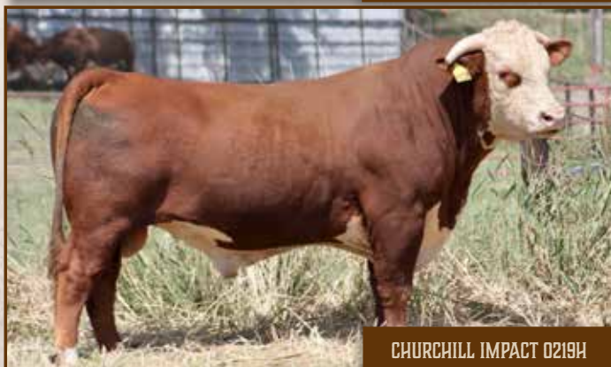
CHURCHILL IMPACT 0219H